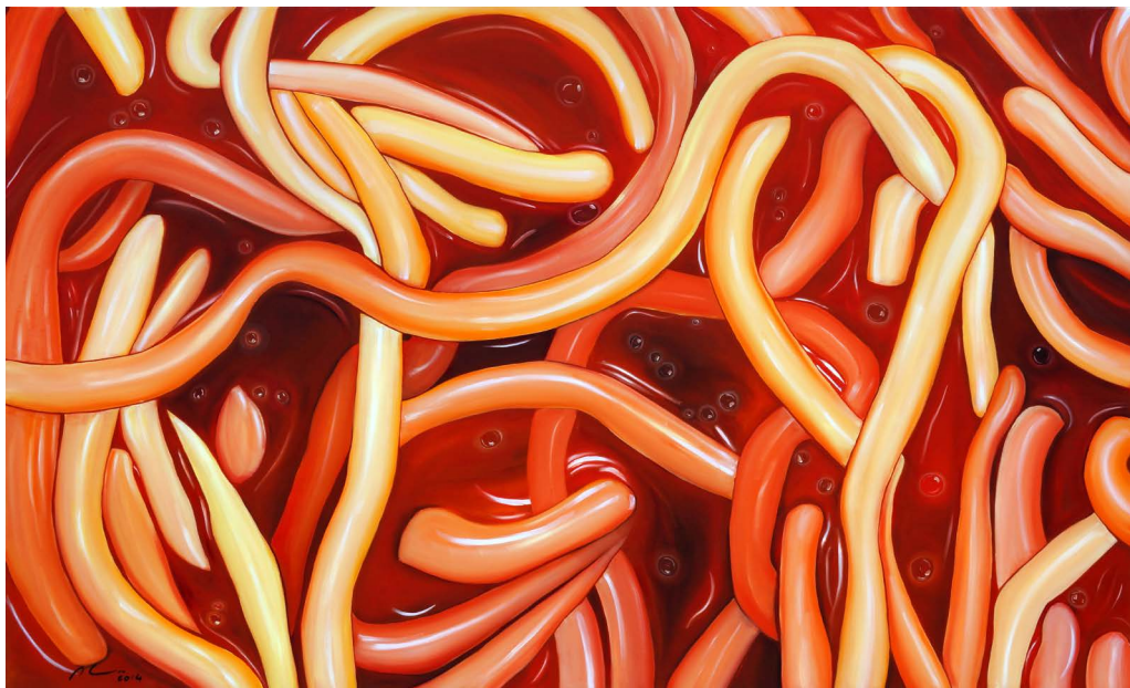
Al-Tabkhah, 2014, oil on canvas, 129 x 213 cm (50.79 x 83.86 inch)