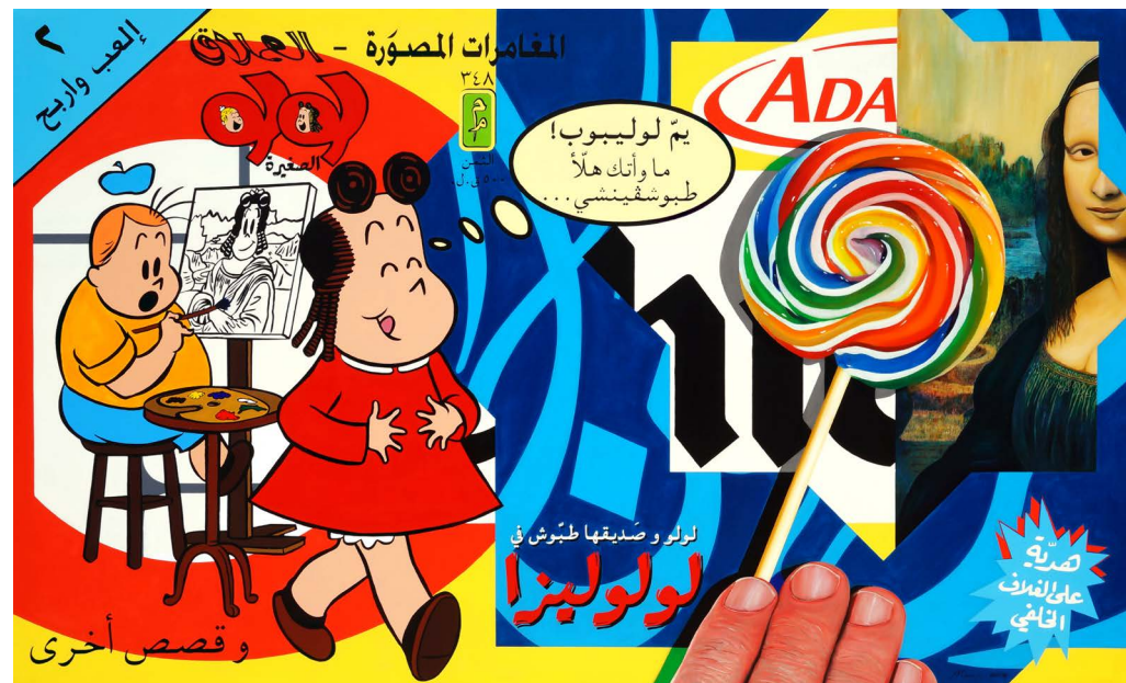
Lulu Liza painting, 2014, oil and acrylic on canvas, 131 x 215 cm (51.57 x 84.65 inch)