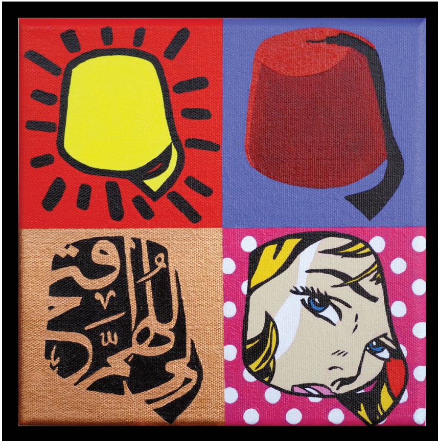
The Tarboush Chronicles no. 2, 2015, acrylic on canvas, 20 x 20 cm (7.87 x 7.87 inch)

“The individual has always had to struggle to keep from being overwhelmed by the tribe. If you try it, you will be lonely often, and sometimes frightened. But no price is too high to pay for the privilege of owning yourself.” Friedrich Nietzsche