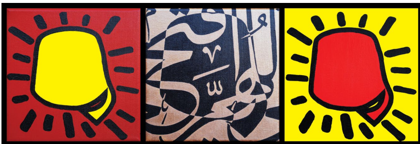
No. 7/8/9, 2015, acrylic on canvas, 20 x 60 cm (7.87 x 23.61 inch)