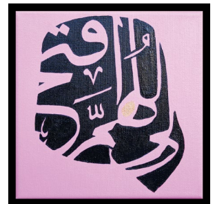
No. 10, 2015, 20 x 20 cm